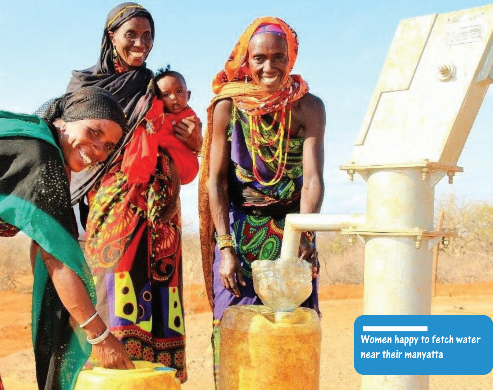
Women happy to fetch water near their manyatta