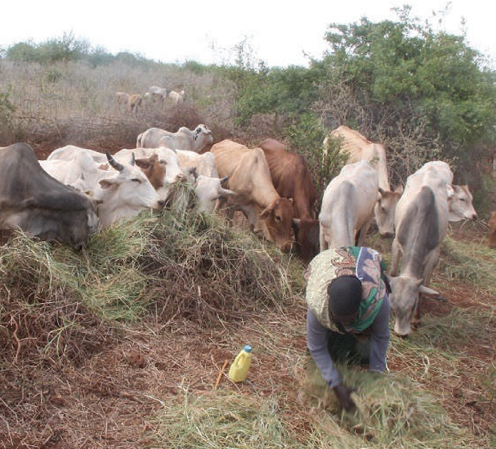
A woman from Jaldesa feeding her cows on hay grown under a PACIDA sustainable livelihoods programme